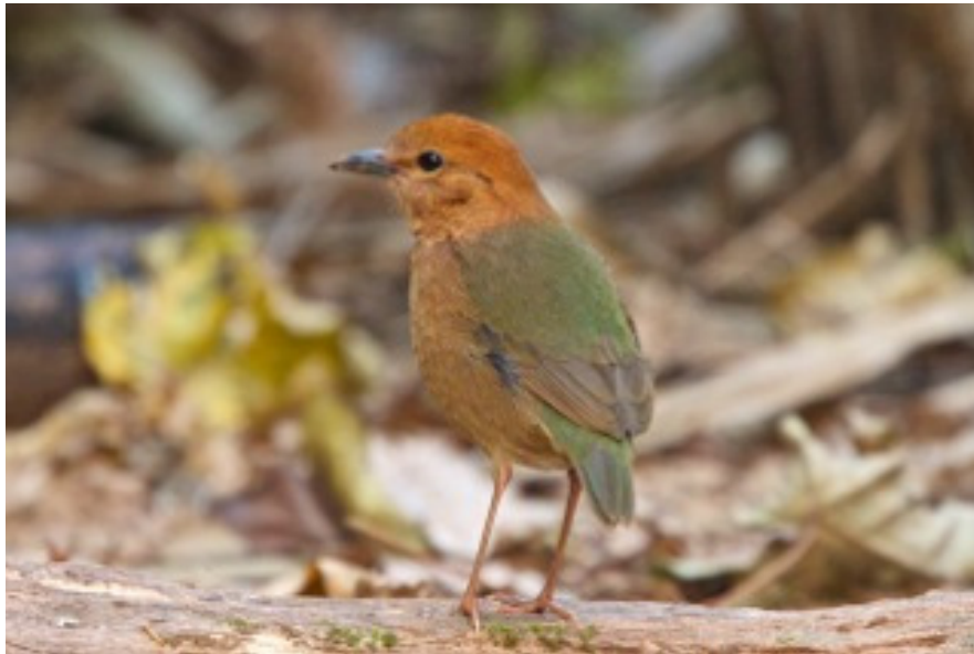
Rusty-naped Pitta