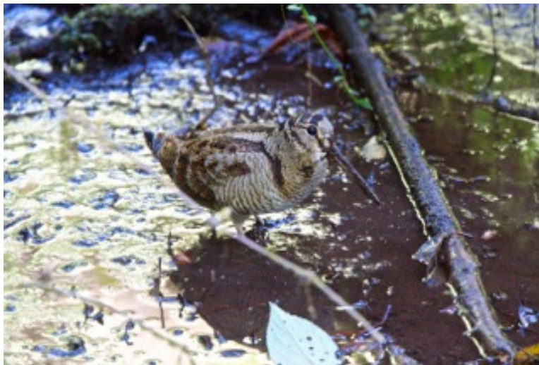
Eurasian Woodcock

With a final morning in Khao Yai National Park, we worked quite hard to add more sightings and started off with some responsive Abbott's Babblers. A pair of Banded Broadbills took a lot more persistence, but gave superb views in the end. A Collared Owlet also obliged in the telescope while a beautiful Blue-winged Leafbird and Eastern Crimson Sunbird were well-appreciated. By evening we were in Chiang Mai in northwest Thailand where a whole bunch of new birds awaited.