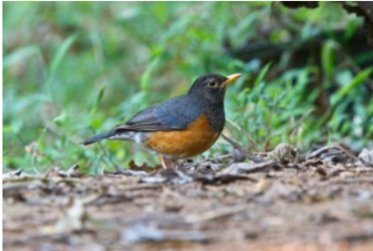
Black-breasted Thrush

We made yet another early start and had breakfast at the summit of Doi Inthanon in cool, crisp conditions. Just about every bird was new for the list, as this was our first morning among the Himalayan avifauna. Over the next two days we watched a treasure trove of beautiful species with some of the highlights including Eurasian Woodcock; Black-tailed Crake; Bay Woodpecker; Gray-chinned Minivet; Yellow-cheeked Tit; Lesser Racket-tailed Drongo; Yellow-bellied Fairy-Fantail; Slaty-bellied Tesia; Mountain Tailorbird; Chestnut-vented Nuthatch; Brown-throated Treecreeper; Flavescent and Mountain bulbuls; Buff-barred, Ashy-throated, Pallas's, and White-tailed Leaf warblers; Snowy-browed and Little Pied flycatchers; Large and Rufous-bellied niltavas; Pale Blue-Flycatcher; White-capped and Plumbeous redstarts; Slaty-backed Forktail; Blue Whistling-Thrush; White-browed Shortwing; Silver-eared Laughingthrush; Pygmy Cupwing; Golden Babbler; Gray-throated Babbler; Silver-eared Mesia; Black-eared Shrike-Babbler; Spectacled Barwing; Rufous-winged Fulvetta; Chestnut-tailed Minla; Rufous-backed and Dark-backed sibilias; Gould's, Green-tailed, and Black-throated sunbirds; and Streaked Spiderhunter.