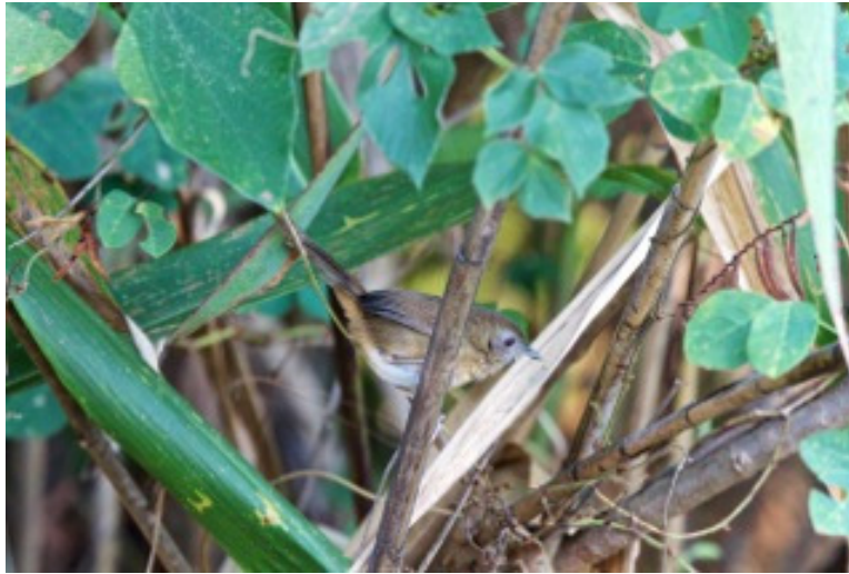
Spot-throated Babbler

Flycatcher; Vivid Niltava; Chinese and Hill blue-flycatchers; White-tailed Robin; Black-breasted Thrush; White-browed Laughingthrush; Scarlet-faced Liocichla; Spot-throated Babbler; Rusty-cheeked Scimitar-Babbler; Pygmy Cupwing; Rufous-fronted Babbler; Blyth's Shrike-Babbler; Blue-winged Minla; Common Rosefinch; Black-headed Greenfinch; and Spot-winged Grosbeak led the charge.