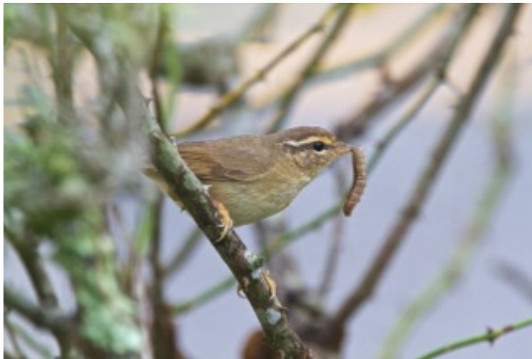
Radde's Warbler

After a comfortable night and a surprise Italian restaurant for dinner, we were off to Khao Yai National Park for three days of exploring the big jungles that are a feature of this well-protected park. It did not take long for things to heat up when a Great Hornbill flew in and perched obligingly, as Wreathed and Oriental Pied hornbills, Vernal Hanging-Parrot, Crested Goshawk, Crested Serpent-Eagle, Thick-billed Pigeon, Mountain Imperial-Pigeon, Asian Drongo-Cuckoo, Blue-bearded and Chestnut-headed bee-eaters, Moustached and Blue-eared barbets, Laced Woodpecker, Greater Flameback, beautiful nest-building Long-tailed Broadbills, Scarlet Minivet, Green Magpie, Black-crested Bulbul, Radde's Warbler, stunning Asian Fairy-bluebirds, White-rumped Shama, White-crested Laughingthrush, Golden-crested Myna, and Golden-fronted Leafbird to mention a few kept us on our toes. We finished the day with a great encounter with a family of three White-handed Gibbons eating Lillypilly fruits over our heads after they had serenaded us all morning with their fabulous territorial songs.