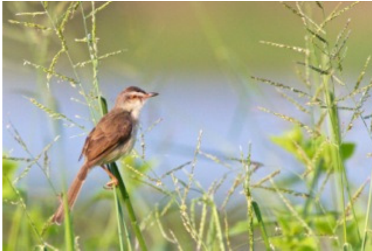
Plain Prinia

Our 2013 Thailand Highlights tour was yet another absolutely fabulous tour to this wonderful country. We recorded 414 species of birds including 12 heard only. Some of the more elusive species we observed so well included Bar-backed and Scaly-breasted partridges, Silver and Hume's pheasants, Green Peafowl, Painted Stork, Spot-billed Pelican, Black-headed Ibis, Collared Falconet, Black-tailed Crake, Asian Dowitcher, Spoon-billed Sandpiper, Eurasian Woodcock, Yellow-vented Pigeon, Blossom-headed Parakeet, Malaysian Hawk-Cuckoo, White-fronted Scops-Owl, Red-bearded Bee-eater, Rusty-cheeked Hornbill, Crimson-winged and Black-headed woodpeckers, Banded Broadbill, Rusty-naped Pitta, Burmese Shrike, Giant Nuthatch, Baikal Bush-Warbler, Spot-breasted Parrotbill, Vivid Niltava, Black-breasted Thrush, Spot-breasted Laughingthrush, Spot-throated Babbler, Purple-naped Sunbird, Chestnut-eared Bunting, and Spot-winged Grosbeak, plus Streaked and Asian Golden weavers. We also encountered 28 species of mammals including an unforgettable Sun Bear, some fascinating reptiles and amphibians, and clouds of stunning butterflies. What a great trip!