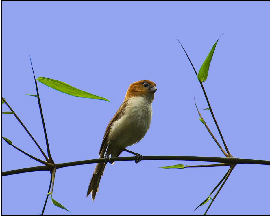
Lesser Rufous-headed Parrotbill above with Slender-billed Scimitar-Babbler below