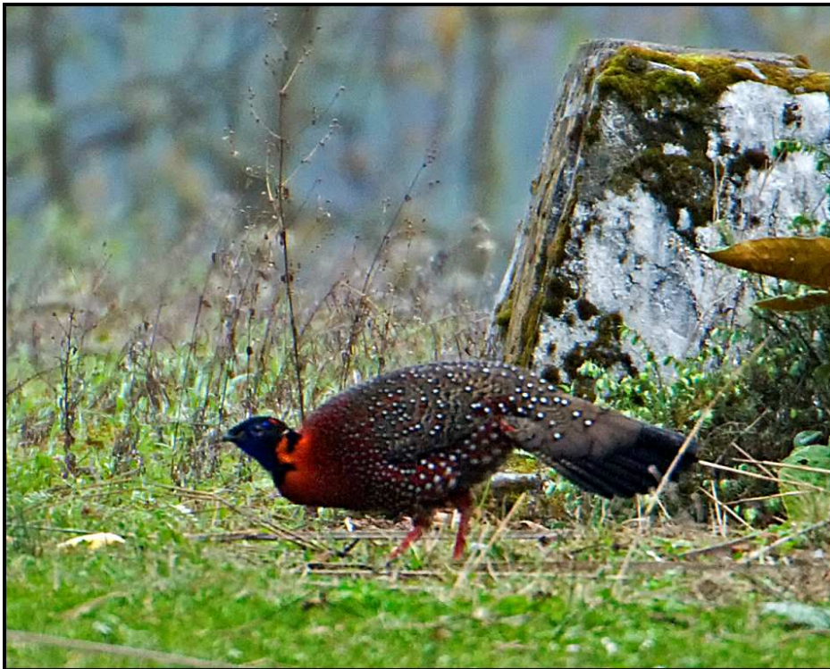
Satyr Tragopan

Peregrine Falcon Falco peregrinus : B: Singles seen three dates; (1) Thimphu on 14 Apr gave a spectacular view hunting Rock Pigeons; (1) on 20 Apr in Jakar Valley and (1) on 30 Apr.