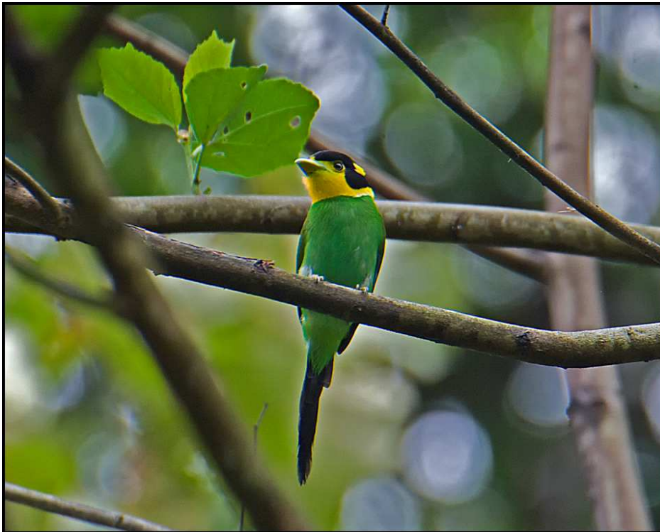
Long-tailed Broadbill

Long-tailed Broadbill Psarisomus dalhousiae : B: (1) on 20 Apr and (2) on 21 Apr at Tingtibi gave superb views of this most beautiful almost unreal species.